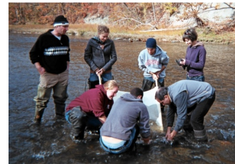
A group of students with the CLEAN Project working in a local stream.