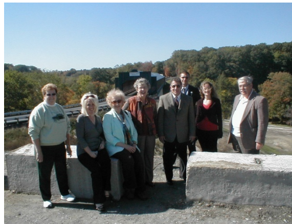
Council volunteers and partners make the difference.

A sustainable, regional community with wild and open spaces, creeks, and lakes, clean water and air, in balance with a mixed economy that includes agriculture, forestry, commerce, industry and tourism.