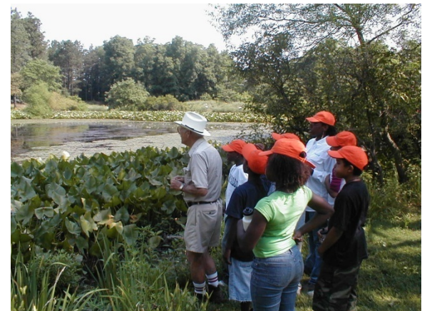
Outreach educational activities help strengthen our communities